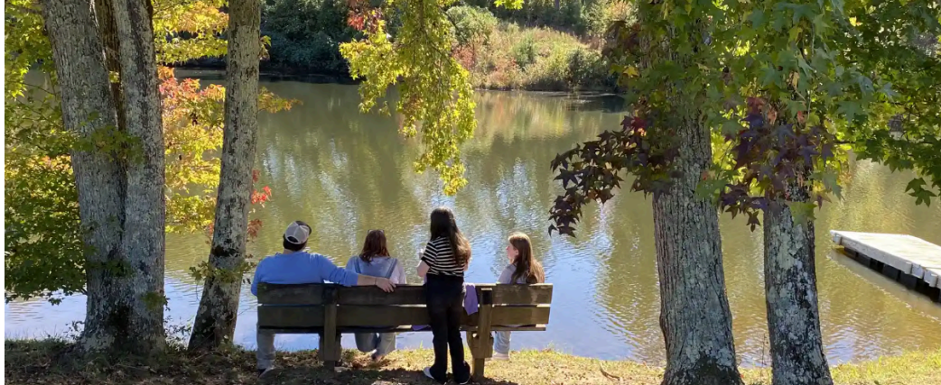
Family retreat attendees take a minute to relax together and enjoy the lake.

It felt as if our family collectively exhaled a deep breath we didn't even realize we had been holding. — The Gonet Family, DFC Campers